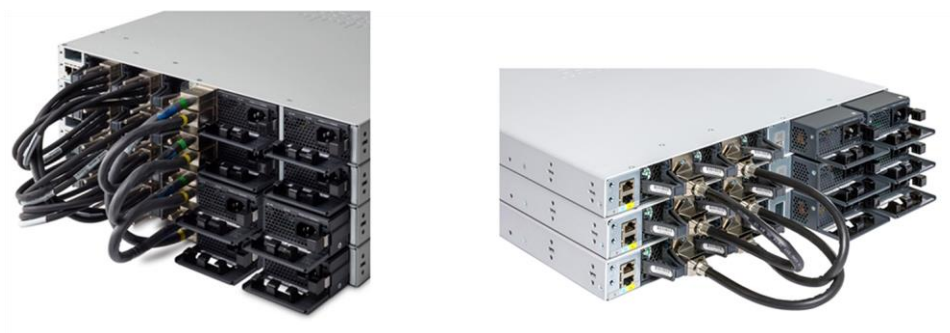
Figure 5. Cisco Catalyst 9300 Series modular uplink models stack (C9300/C9300X SKUs) and fixed uplink models stack (C9300L SKUs)

Cisco Catalyst 9300 Series switch models are designed for stacking switches as a single virtual switch, enabling customers to have a single management plane and control plane for up to 448 access ports.