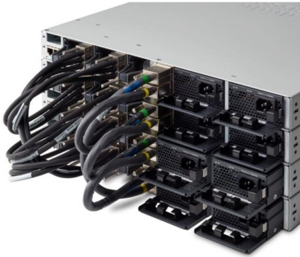
Figure 7. Cisco Catalyst 9300 Series StackPower