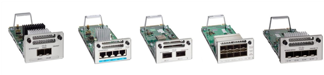
Figure 3. Cisco Catalyst 9300 Series Network Modules