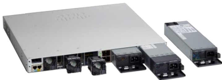
Figure 4. Cisco Catalyst 9300 Series Dual Redundant power supplies

Cisco Catalyst 9300 Series switches support dual redundant power supplies. The switches ship with one power supply by default, and the second power supply can be purchased when the switch is ordered or at a later time. If only one power supply is installed, it should always be in power supply bay #1. The switches also ship with three field-replaceable fans. Power Supplies are common across the Catalyst 9300 Series.