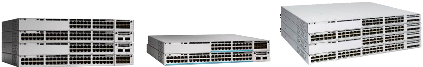
Figure 1. Cisco Catalyst 9300 Series switches

The Cisco Catalyst 9300 Series is made up of nineteen modular uplink switch models and fourteen fixed uplink switch models.